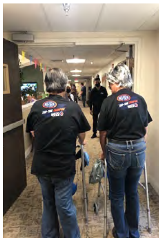
TWINS DAY—RESIDENTS & STAFF!