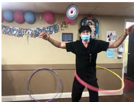
WHAT THE STAFF HAS TO DO TO ENTERTAIN THE RESIDENTS!!!